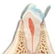
Healthy Teeth and Gums