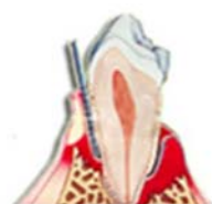
Stage 3 Advanced Periodontal Disease & Bone Loss