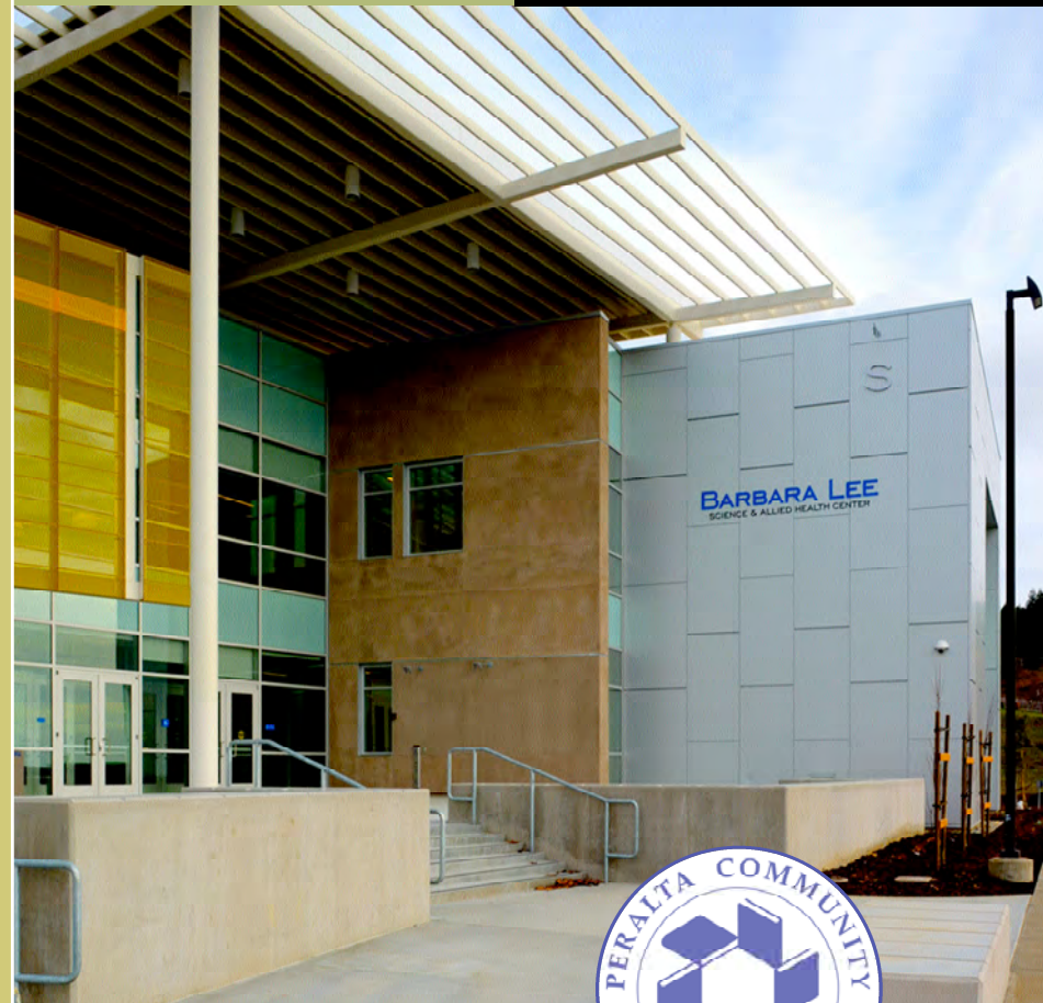
Barbara Lee Center for Science and Allied Health dedicated at Merritt College in November 2015