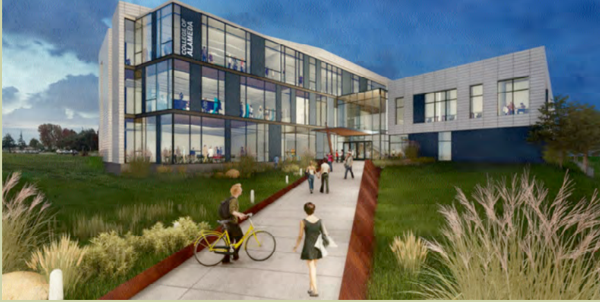
December 2019 Center for Liberal Arts, projected completion College of Alameda, $42,077,545