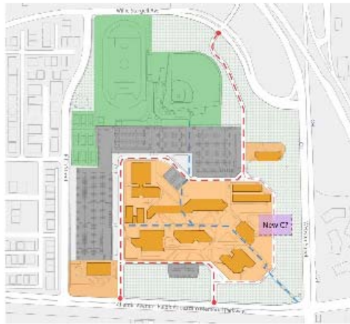
College Of Alameda site map & Approximate Building C location