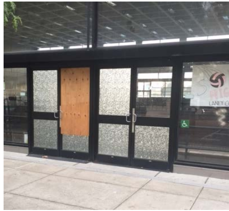
Gym – Front Door at Courtyard Item 17