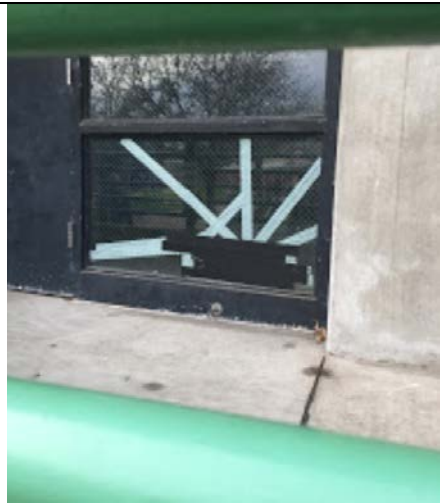
Pool Storefront (rear exit) Item 19