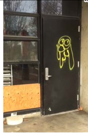
E102 – Bakery rear exit