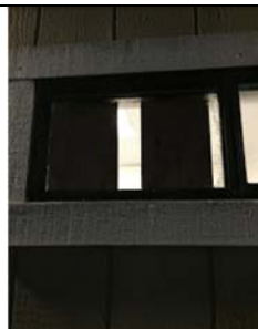
Eagle Village -Bathroom Window Item 16