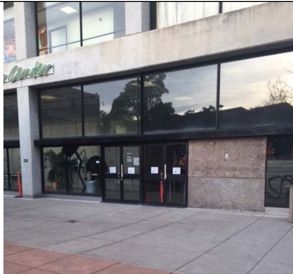
Theater at Courtyard Item 20