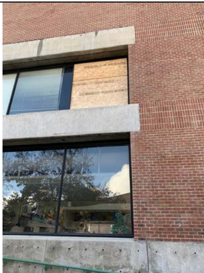
Student Center – 3 rd Fl. South Wall Item 23