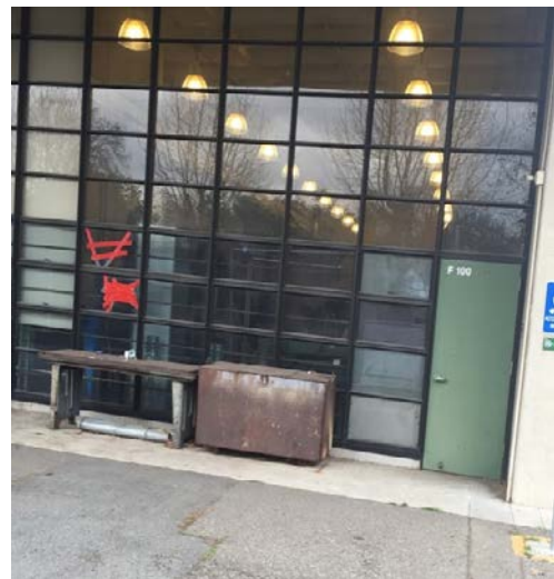
F100 – Back Side of Welding