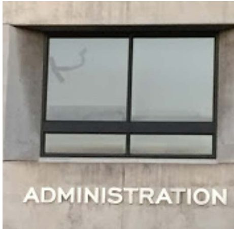
Tower – T250 health services Item 21