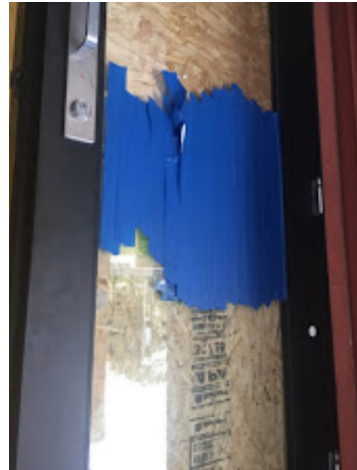
Art Center Storefront Door Item 22