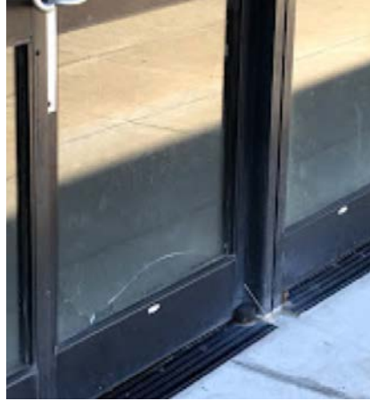
Gym door – pool side Item 18