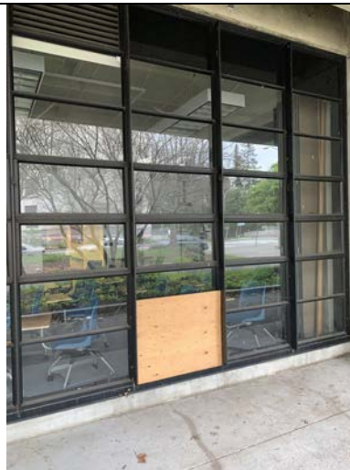
A152 – 10 th Street Side Item 24