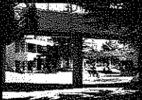
College of Alameda