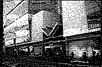
Berkeley City College